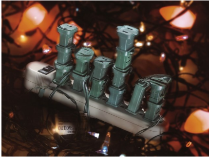
Holiday safety, photo: Arizona Structures

We send our heartfelt wishes to you and your family to enjoy a joyous holiday season and encourage you to make it a safe one, too.