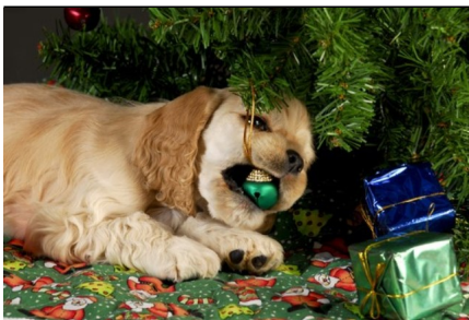
Holiday safety

We send our heartfelt wishes to you and your family to enjoy a joyous holiday season and encourage you to make it a safe one, too.