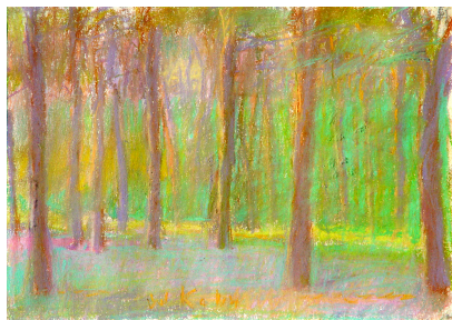
Understory I by Wolf Kahn