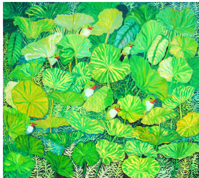
Todi Birds by Hunt Slonem

For the first time in 35 years, a collection of works from internationally-acclaimed artists Beth Ames Swartz, Hunt Slonem and Wolf Kahn will be available for public viewing and purchase.