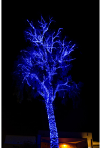
Phoenix Zoo Lights

Get into the holiday spirit this season by visiting the variety of homes, businesses and parks across the Valley that offer thousands of twinkling light displays to the public. So grab your coat, some hot chocolate and bring the whole family to check out our recommendations for the top 10 Christmas light displays in the Valley.