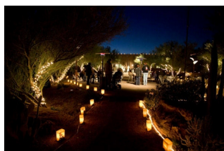
Las Noches de las Luminarias

Information: The site is located at: 1201 North Galvin Parkway, Phoenix. Now through Dec. 30. 5:30 to 9:30 p.m. www.dbg.org .