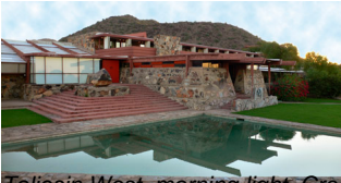
Taliesin West, morning light.