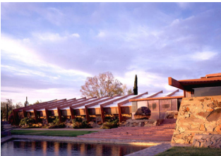
Taliesin West.