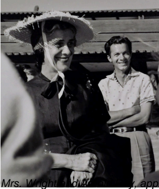
Mrs. Wright and Frank Lloyd Wright, apprentice, circa 1950's.