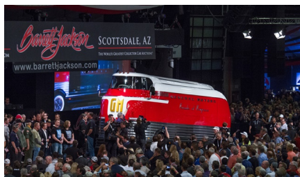
Futurliner.

Cars and community: For 45 years, Barrett-Jackson, The World's Greatest Collector Car Auctions®, has celebrated both in classic style.