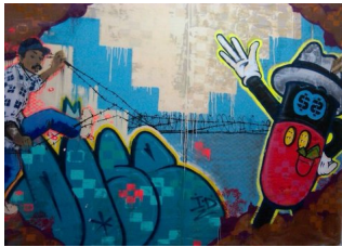
Illegal-Legal by DOSE