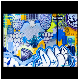
"Old Money" by DOSE in collaboration with Hector Ruiz

My peers, all the struggles I've encountered in my life like racism, assimilation and discrimination to random acts to kindness and compassion. Anything that affects me as a person inspires me.