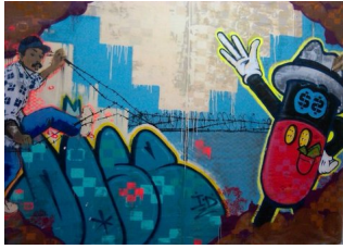
Illegal-Legal by DOSE