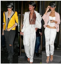
Some of the bold and unique fashion choices of Rihanna.