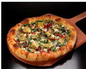
Thirsty Lion Gastropub & Grill

If you're in search of something strong to calm those game-day jitters, head to Camelback Inn's R Bar for over-the-top cocktails. Both the Super Bowl Shandy, made with prickly pear lemonade and Corona, and the Hail Mary Michelada, a spicy blend of tomato juice, Dos XX Lager, lime juice, Worcestershire and hot sauces and Maggi seasoning, finished with a chili salted rim, ought to do the trick. Don't forget about R Bar's Happy Hour bites—the Super Bowl Shandy pairs well with the chicken quesadilla, while the Hail Mary Michelada is the perfect accompaniment to a bowl of fresh tableside guac. http://www.marriott.com/hotel-restaurants