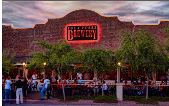
Four Peaks Brewery

On Feb. 1, the Seattle Seahawks and the New England Patriots will face off at University of Phoenix Stadium for the biggest game of the year. If you didn't snag a ticket—and let's get real, who did?—don't sweat it. Any one of these popular spots would love to have you. Check them out this weekend for killer deals and a wild time.