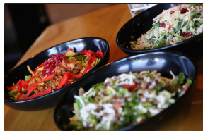
Half Moon Sports Grill

From 3 p.m. to 7 p.m., enjoy $4 featured pints, select wine, specialty cocktails or one of 52 local, craft, import and domestic beers on draft—all while tuning into one of 16 60-inch TV's. Food is dirt cheap and delicious, with prices hovering between $3.95 and $5.95. thirstyliongastropub.com/tempe