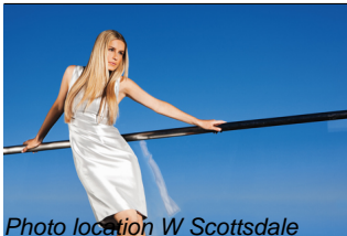
Photo location W Scottsdale

Jill Sander cobalt blue dress with ruched mock turtleneck, $745. Dominique Aurientis gold earrings with crystals, $525. Both Neiman Marcus, Scottsdale Fashion Square.