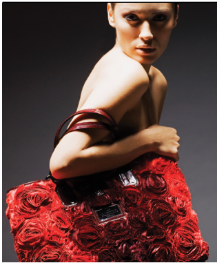
Valentino raspberry-color rosebud handbag with Bordeaux-color patent straps, $1,950. Saks Fifth Avenue.