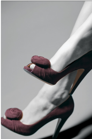
Prada aubergine-color suede peep-toe pumps with rose detail, $695. Neiman Marcus.