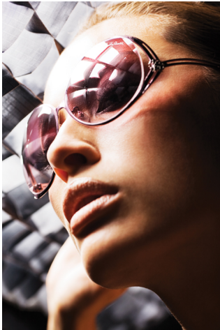
Roberto Cavalli purple sunglasses with Bordeaux-color lenses, $340. Saks Fifth Avenue.

Too sweltering for a fall dress or boots? Yes! Too early to lavish in the latest fall accessories? Never! This season they're bigger, bolder and better than ever.