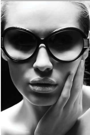
Oliver Peoples tortoise sunglasses with tan trim, $340. Neiman Marcus.