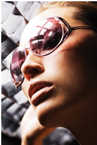
Roberto Cavalli purple sunglasses with Bordeaux-color lenses, $340. Saks Fifth Avenue.

Too sweltering for a fall dress or boots? Yes! Too early to lavish in the latest fall accessories? Never! This season they're bigger, bolder and better than ever.