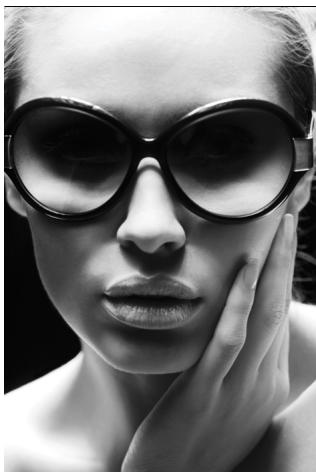
Oliver Peoples tortoise sunglasses with tan trim, $340. Neiman Marcus.