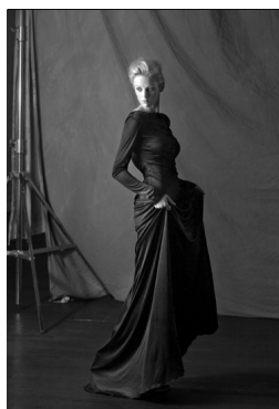
Oday Shakar navy silk jersey gown with deep-plunging back, $2,995. www.odayshakar.com .