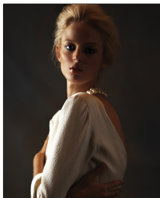
Oday Shakar ivory silk and wool brocade dress, $2,195. www.odayshakar.com .