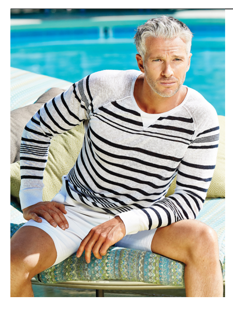
Diesel navy and white cotton striped sweater, $158. Vince white cotton shorts, $95. Neiman Marcus.