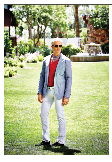
Hugo Boss black Mical stretch cotton two-button blazer, $545. White-washed slim jean, $165. Armani Collezioni cotton print shirt, $325. Cotton V-neck sweater, $275. Saks Fifth Avenue. Götti Switzerland Percy in titanium, $310. The Oculist Exceptional Eyewear. Model's own belt and shoes.

Armani Collezioni black flax short-sleeve shirt, $325. Cotton trouser, $375. David Yurman and John Hardy leather, rubber and silver assorted bracelets, $350-$895. Masunaga Optical frames in olive tortoise, $360. The Oculist Exceptional Eyewear.